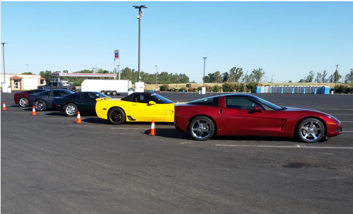
Preferred parking at Corning Ribs & Rods